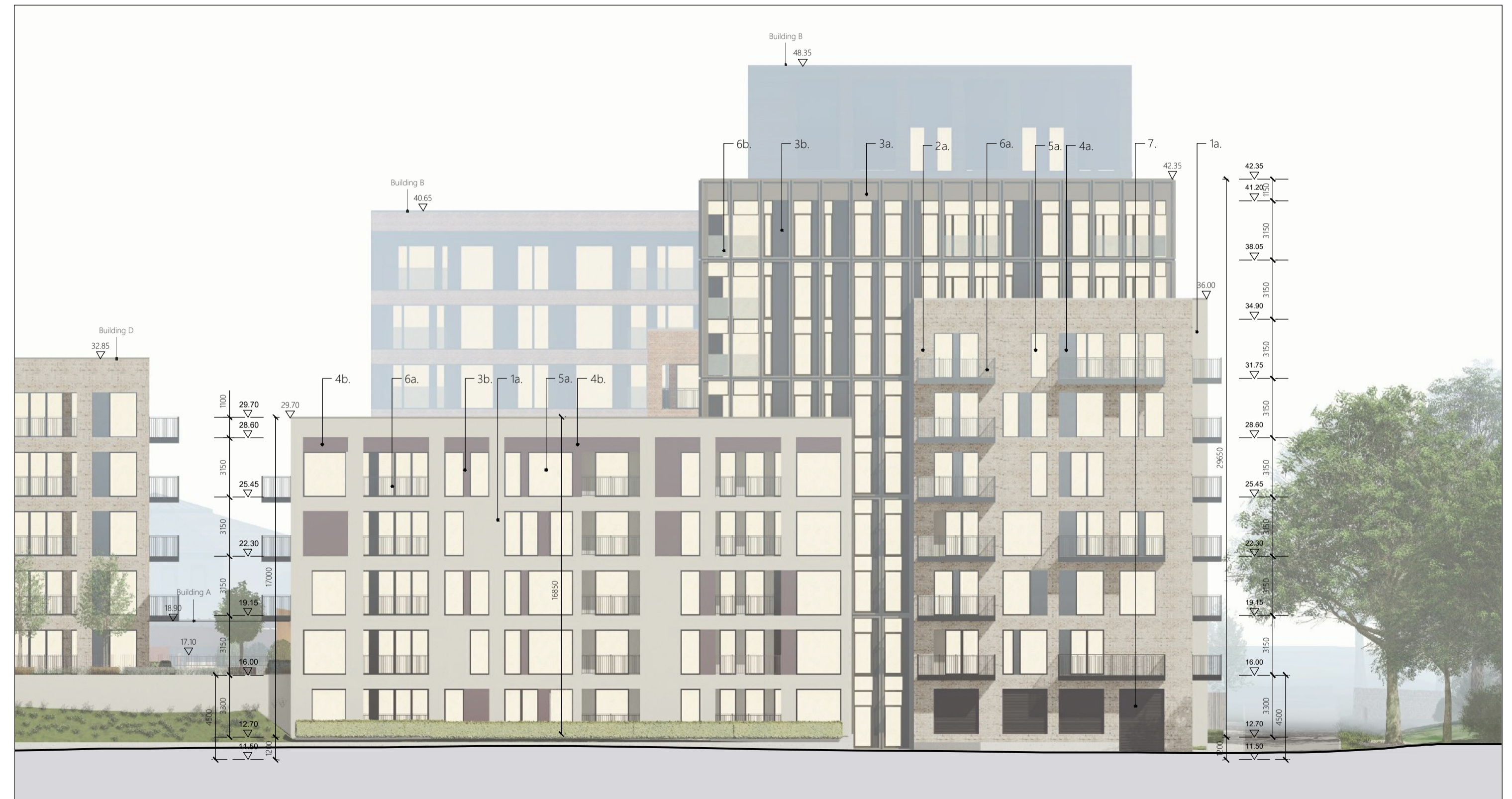
4 BUILDING C: SOUTH ELEVATION C4 SCALE 1:200