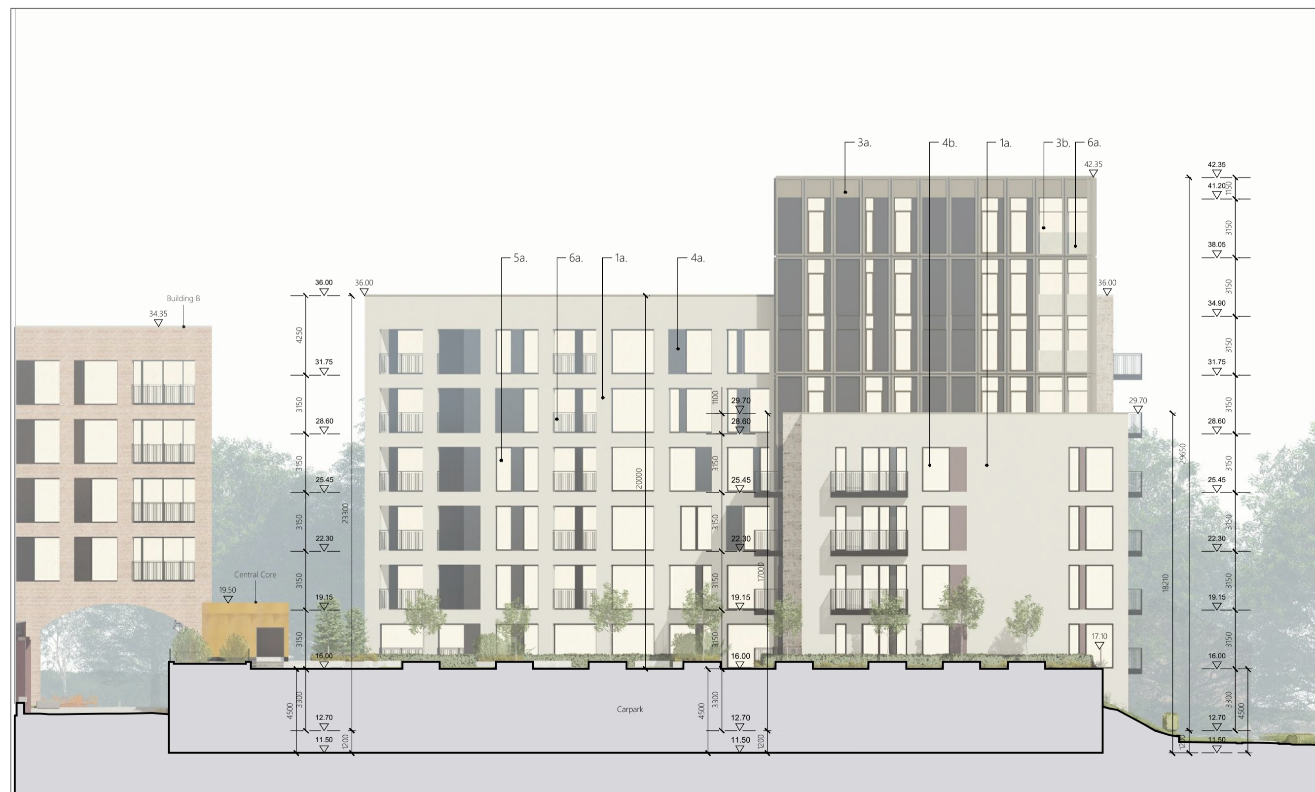
3 BUILDING C: WEST ELEVATION C3 SCALE 1:200