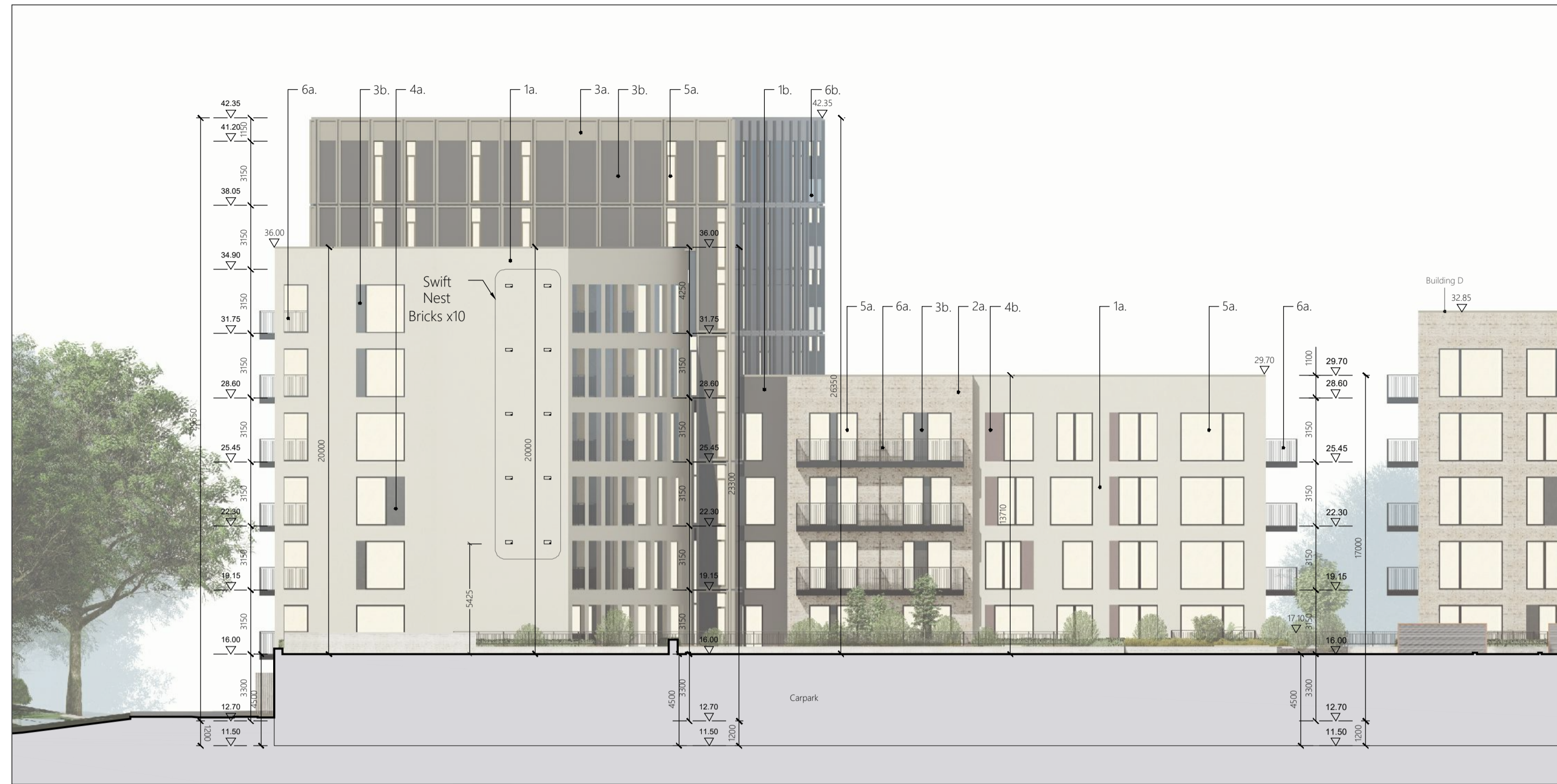
1 BUILDING C: NORTH ELEVATION C1 SCALE 1:200