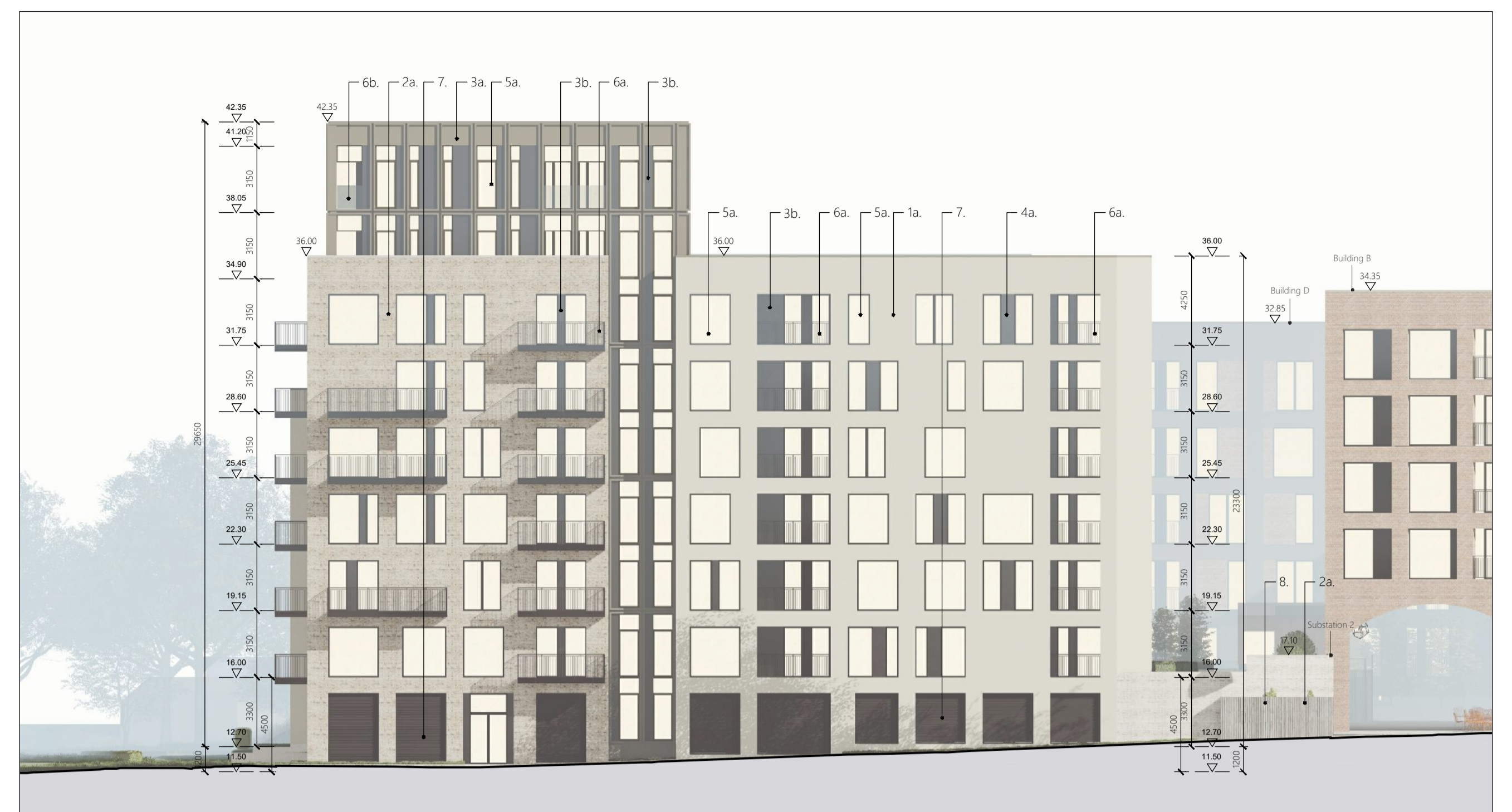
2 BUILDING C: EAST ELEVATION C2 SCALE 1:200